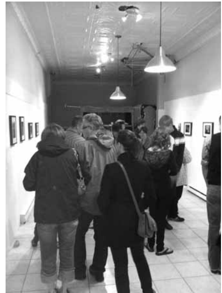
▲ Photovoice gallery