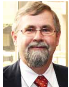
Blood Matters Summer 2011 /5

While staff can provide support in this endeavour, it is truly the role of Hemophilia Ontario's volunteers to lead the organization through the challenges of the coming years. ♦